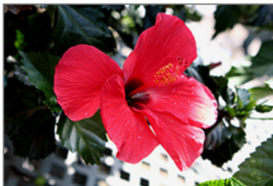
Pink Versicolor Hibiscus flowers

This plant does best in full sun to partial shade. It requires an evenly moist well-drained soil for optimal growth, but will die in standing water. To help this plant achieve its best flowering performance, periodically apply a flower-boosting fertilizer from early spring through into the active growing season. It is not particular as to soil pH, but grows best in rich soils. It is highly tolerant of urban pollution and will even thrive in inner city environments. Consider applying a thick mulch around the root zone in winter to protect it in exposed locations or colder microclimates. This is a selected variety of a species not originally from North America. It can be propagated by cuttings; however, as a cultivated variety, be aware that it may be subject to certain restrictions or prohibitions on propagation.