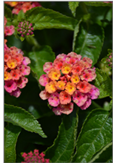
Bandolero Cherry Sunrise Lantana flowers

An excellent selection that is heat and drought tolerant; beautiful flower clusters sit on top of dark green, fragrant foliage; little to no deadheading needed; perfect for garden landscapes, patio containers and hanging baskets