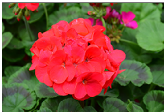
Maverick Red Geranium flowers