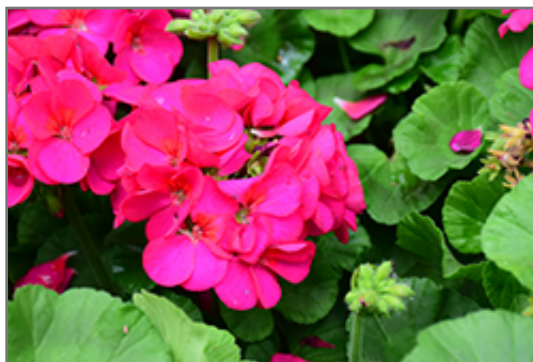
Maverick Violet Geranium flowers