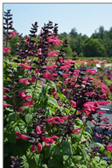
Bodacious Jammin' Jazz Sage flowers