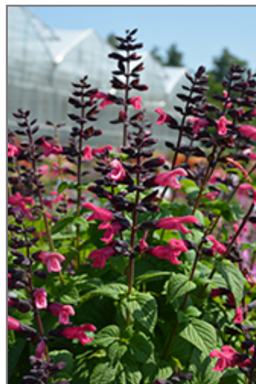
Bodacious Jammin' Jazz Sage flowers

This plant will require occasional maintenance and upkeep, and is best cleaned up in early spring before it resumes active growth for the season. It is a good choice for attracting bees, butterflies and hummingbirds to your yard, but is not particularly attractive to deer who tend to leave it alone in favor of tastier treats. It has no significant negative characteristics.