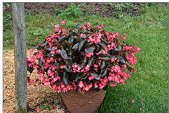
Dragon Wing Pink Bronze Leaf Begonia in bloom