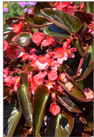
Dragon Wing Pink Bronze Leaf Begonia flowers

This is a high maintenance plant that will require regular care and upkeep, and usually looks its best without pruning, although it will tolerate pruning. Deer don't particularly care for this plant and will usually leave it alone in favor of tastier treats. Gardeners should be aware of the following characteristic(s) that may warrant special consideration;