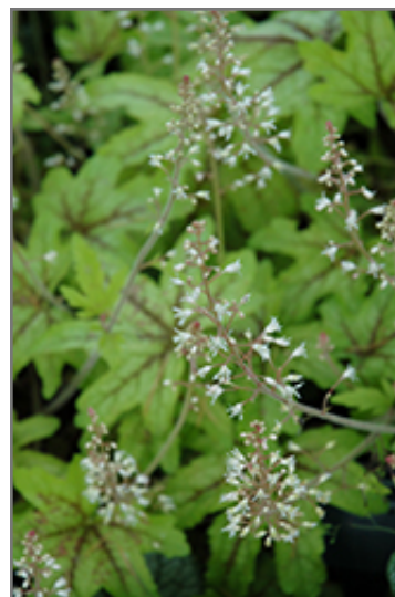
Alabama Sunrise Foamy Bells flowers