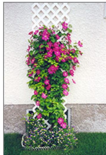
Ville de Lyon Clematis in bloom